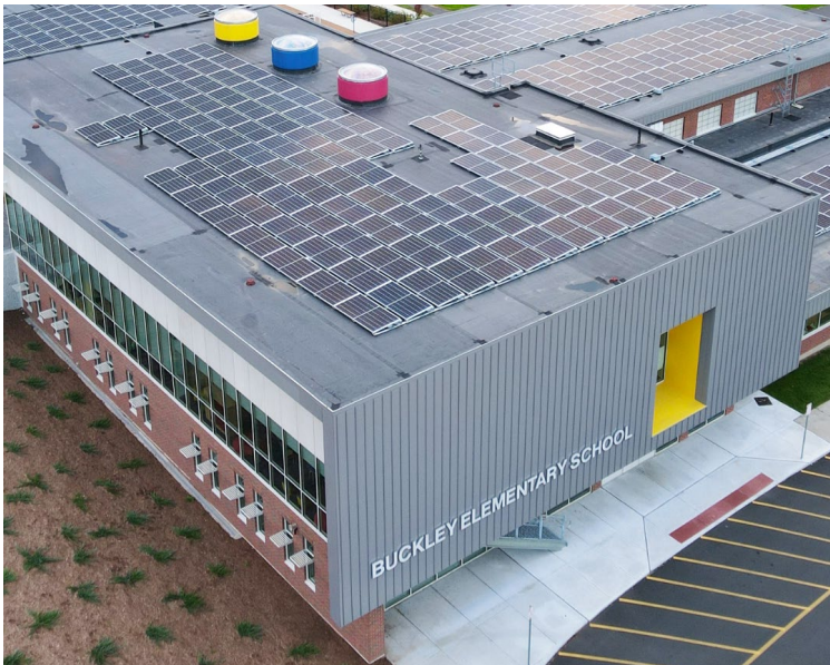
CMTA's first-place winning design Buckley Elementary in Manchester, CT